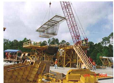
I-95/I-295 North Interchange Project

The GTI coupler system has been approved by the FDOT for use on the North Interchange project and they are currently being utilized in the structure. Thus far, through the segment pre-casting phase of the project, the couplers have performed successfully. As the project progresses into the segment erection phase, the couplers will continue to be evaluated to ensure they are meeting the intended goals.