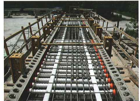
The GTI coupler system has been approved by the FDOT for use on North Interchange project and they are currently being utilized in the structure